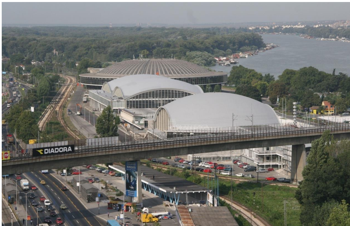
Belgrade Fair - aerial view of the rivier Sava

According to the GRP of Belgrade, Belgrade Fair complex is located in the commercial features zone in the multi-level zone (K1) and belongs to the characteristic unit I – The Center of Belgrade, which enables the existing Fair operation continuation and advancement.