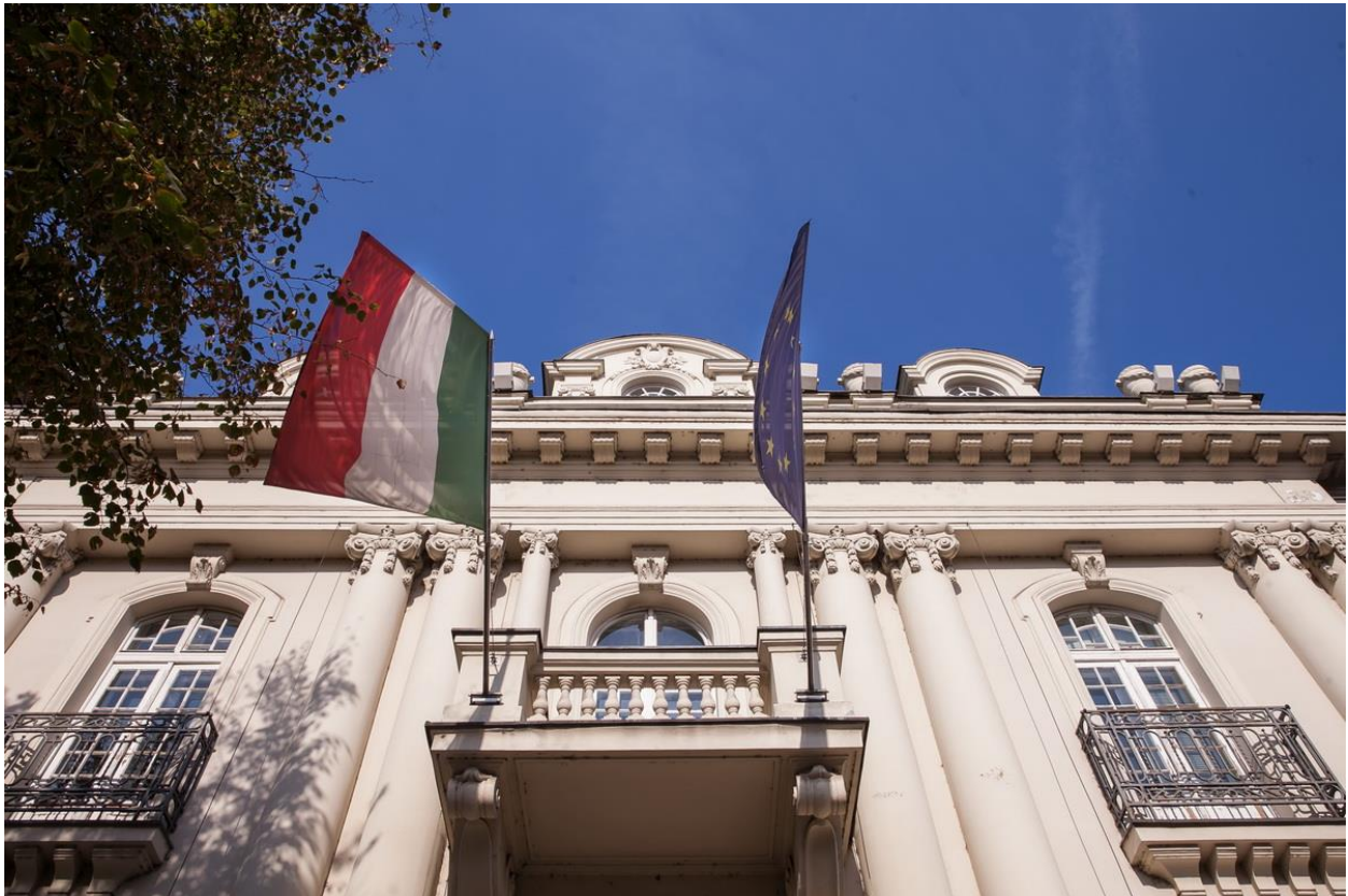
Italian Institute of Culture, Palazzo Italia , Belgrade http://www.iicbelgrado.esteri.it/iic_belgrado/it/