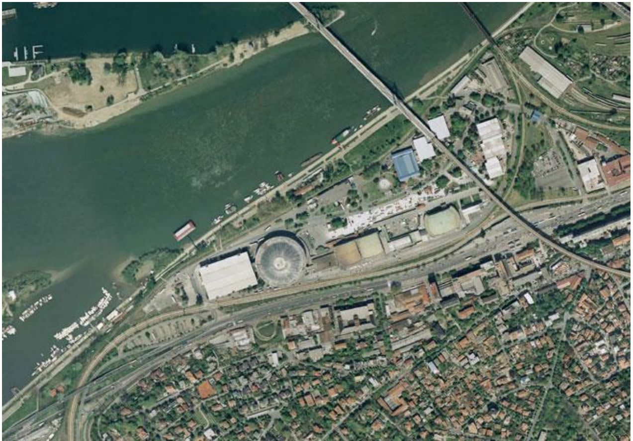
Site plan of the complex of Belgrade Fair ( http://sajam.rs/en/ )

Belgrade Fair is situated on the right bank of the river Sava. The Belgrade fair location is very attractive and easy accessible, since it belongs to the Central Zone situated on the main longitudinal base of the city development, within the busiest radial direction (Bulevar vojvode Mišića Street). The distance from the city's strategic points is 11 km from Nikola Tesla Airport and about 1 km from the main Railway Station, between the new planned railway stations Prokop and New Belgrade.