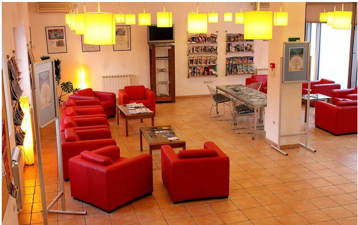
Existing "mediateca" space, Italian Institute of Culture, Palazzo Italia , Belgrade